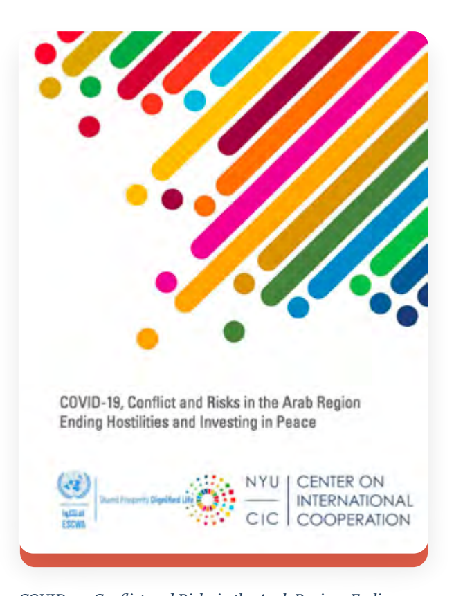
COVID-19, Conflict and Risks in the Arab Region: Ending Hostilities and Investing in Peace, co-published with the United Nations Economic and Social Commission for Western Asia and the Peace Research Institute Oslo, January 2021.

The program has also remained closely engaged in specific country and regional contexts, partnering in Bangladesh with BRAC and UN Women to conduct a large-scale survey of Bangladeshi migrant workers who fled en masse from the cities to rural areas when the country locked down. The survey revealed several alarming trends—a surge in child marriages, a fall in remittances far beyond official estimates, skyrocketing debt levels, a mounting mental health crisis, and growing