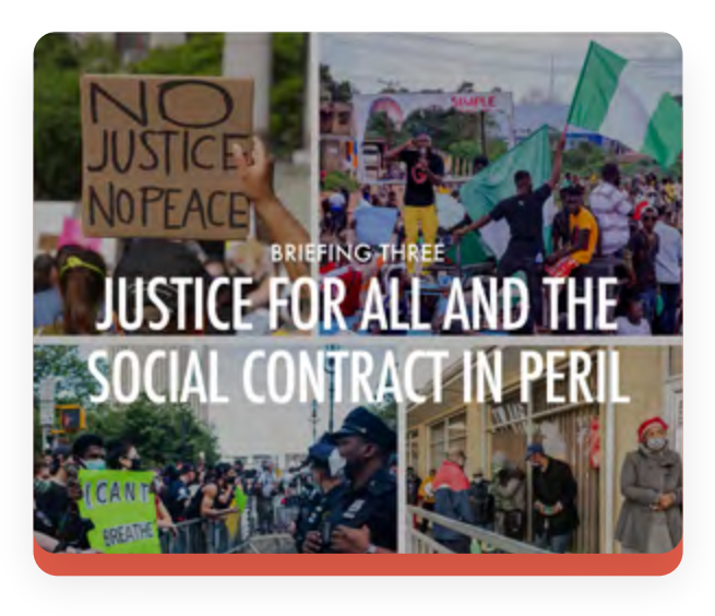
Justice in a Pandemic Briefing Series: Briefing Three - Justice for All and the Social Contract in Peril, July 2021.

This past year has been an extremely productive time for the Grand Challenge on Inequality & Exclusion, with over twenty research papers written and published, ten events, and over seventeen thousand members of the public polled in eight countries. These outputs, as well as the last three years of work since the Grand Challenge was launched under the leadership of the Advisory Council, culminated in the launch of a flagship report, From Rhetoric to Action: Delivering Equality and Inclusion , in September 2021.