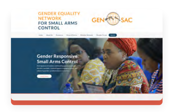
New GENSAC website launched in 2021.

This year also saw further consolidation of the Gender Equality Network for Small Arms Control (GENSAC)—for which Pathfinders serves as a secretariat—congregating members from the Western Balkans, Africa, Latin America, and the Caribbean to advance gender-responsive small arms control, particularly through policy publications and advocacy around major international gatherings, including side events at the UN's seventh Biennial Meeting of States (of the UN Programme of Action on Small Arms Light Weapons) and Seventh Conference of States Parties (CSP7) to the Arms Trade Treaty.