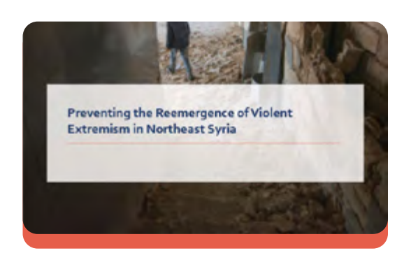
Preventing the Reemergence of Violent Extermism in Northeast Syra report, March 2021.

In March 2021, CIC published a study in collaboration with the National Agenda for the Future of Syria Programme at UN ESCWA looking at the vulnerabilities contributing to the risk of violent extremist groups—including the possibility of the IS regaining a foothold in Northeastern Syria. A key finding is that all the factors that previously allowed for the rise of armed extremist groups—lack of accountability, marginalization, corruption, impunity for the ruling elites, lack of