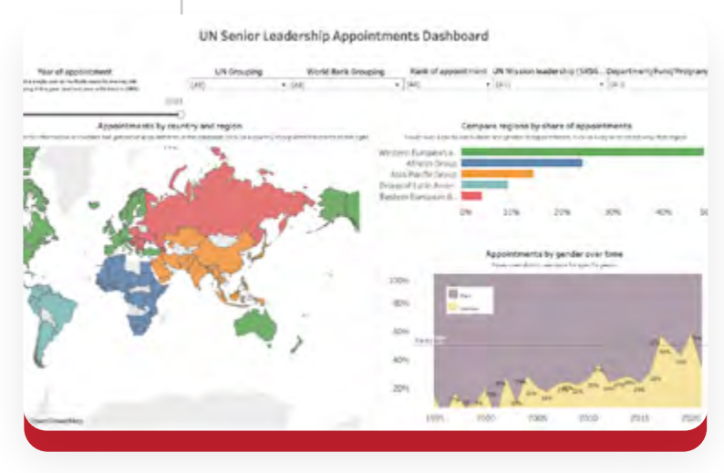
{\it UN \, Senior \, Leadership \, Appoint ments \, Dashboard, \, October \, 2020.}

CRG launches parliamentary tracker Talatala