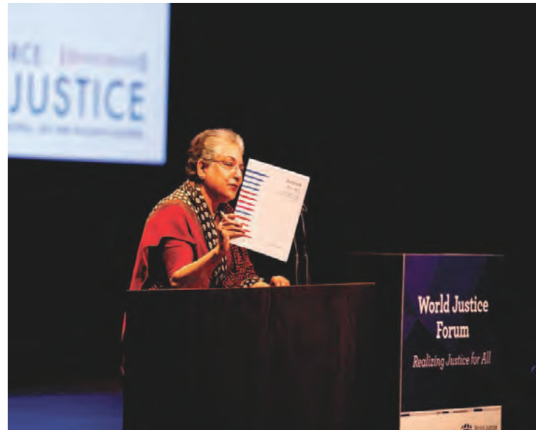
Above: Hina Jilani of the Elders, co-chair of the Task Force on Justice, addresses the World Justice Forum in The Hague in April 2019.

Force’s research through data analysis, policy commentary, and reviews of available evidence, resulting in multiple reports and working papers that form the basis for future action. This alliance—and the support of justice leaders and activists around the world—will provide the basis of a new phase of Pathfinders’ work on justice.