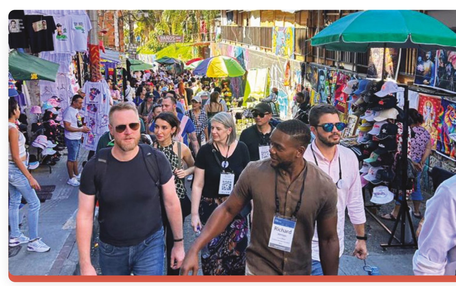
Participants in the Peace in Our Cities convening exploring successful urban violence reduction initiatives (Palmira, Colombia, June 2023)

In May 2023, the Gender Equality Network for Small Arms Control (GENSAC) relaunched, gaining recognition in key international arms control forums. GENSAC representatives took part in the final session of the UN Open-Ended Working Group on Ammunition, advocating for a gender-inclusive arms control approach and the inclusion of women in these processes. GENSAC also ensured representation from women in civil society at arms control discussions at the Conference of States Parties to the Arms Trade Treaty, the SGD16+ Rome Conference, and ECOWAS, and convened Latin American elected leaders to address legislation aimed at combating femicide by restricting gun ownership for convicted domestic violence offenders.