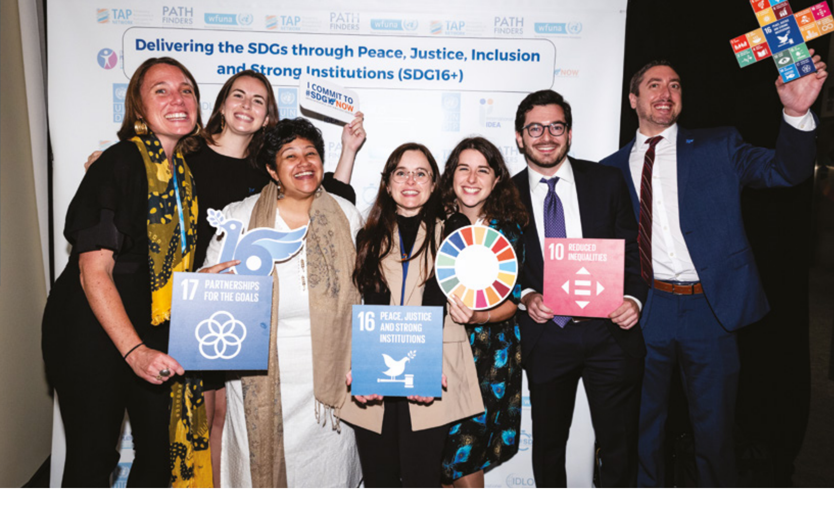
Pathfinders team photo at the SDG16+ Coalition event on the sidelines of the UN General Assembly (New York, USA, September 2023. Photo credit: Joel Sheakoski)