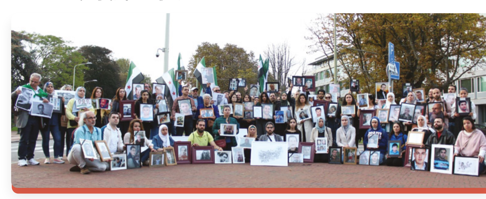
Families, survivors, and \ activists \ came \ together \ to \ advocate \ for \ the \ rights \ of \ victims, \ aiming \ to \ end \ enforced \ disappearances \ in \ Syria \ (The \ Hague, Netherlands, November 2023. \)

Finally, through its MENA program, CIC and partners helped raise concerns about the inadequate international response to the February 2023 earthquake in Turkey and Syria, prompting a call to the UN secretary-general to initiate an inquiry, subsequently leading to an internal review.