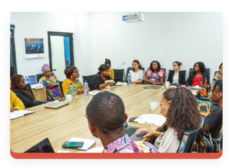
CRG and Ebuteli hosted a discussion on "Gender Equality in the DRC: Priorities for 2023" to highlight women's participation in politics (Kinshasa, DRC, February 2023)

• The last report in the series, "Power Games, Game of Power: Soccer and Politics in the DRC" (from the original French title: "Jeux de pouvoir, pouvoir du jeu: football et politique en RDC"), revealed how political figures leading Congolese soccer clubs leverage their positions to enhance their image and gain electoral benefits.