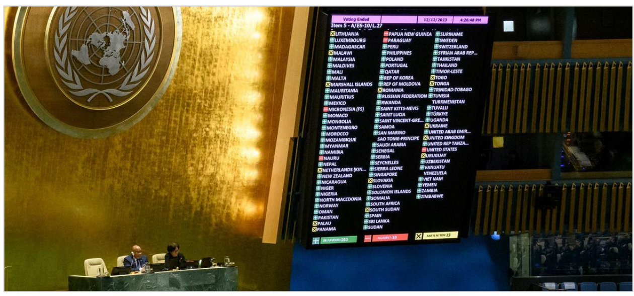
The UN General Assembly adopted a resolution demanding "an immediate humanitarian ceasefire" on December 12, 2023.

On December 12, 2023, the UN General Assembly adopted a resolution to demand an "<u>immediate humanitarian ceasefire</u>" in Gaza. A total of 153 countries voted in favor of it, 10 countries voted against, including the US and Israel, while 23 abstained. Subsequently, on December 22, the UN Security Council adopted a <u>resolution to facilitate greater humanitarian aid access in Gaza</u>. With 13 votes in favor and US and Russia abstentions, the resolution called for "conditions for a sustainable cessation of hostilities" but did note mandate a cease-fire.