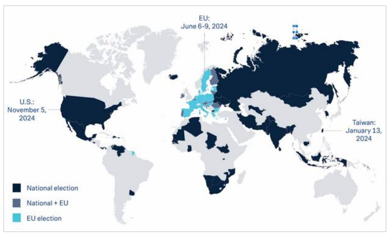
Global elections in 2024, the biggest election year in history.

In 2024, a <u>record-breaking 40-plus national elections</u> are set to take place across the globe, marking the largest election year ever recorded in history. Voters in countries accounting for over 40 percent of the world's population and an equivalent share of its gross domestic product (GDP) will choose new governments, potentially ushering in significant domestic and geopolitical shifts.