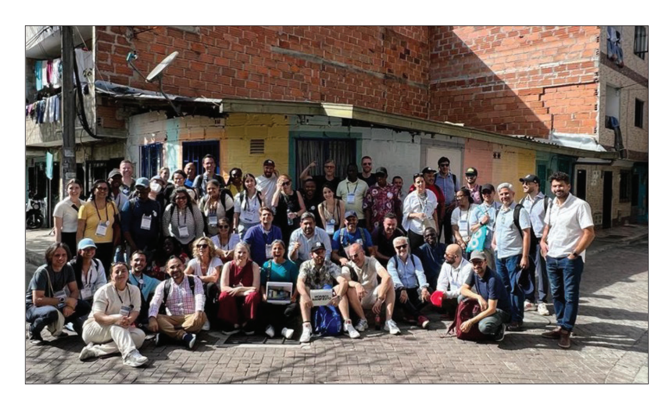
"I truly believe that by working together we can achieve more, and we can achieve legitimacy. Prevention is not the easiest or fastest solution, but it is the right one!"

The morning panels closed with a discussion between representatives from the Life & Peace Institute (Kenya) and the City of Kumanovo (North Macedonia), who highlighted how they work directly with community members to understand deficits in legitimacy and build efforts that address these deficits in order to enhance the legitimacy of state institutions, particularly law enforcement. This panel underscored the importance of integrating communities into project design, decision-making mechanisms, and implementation processes, as well as the support cities received from international networks in the project design and implementation stage. The Life & Peace Institute was the recipient of a Peace Incentive Fund grant from the PiOC network, while the City of Kumanovo is also an active member of the Strong Cities Network, PiOC partner organization working on issues of hate, extremism, and polarization.